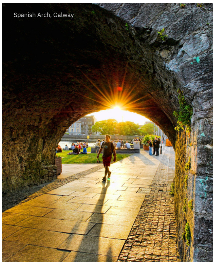
Spanish Arch, Galway